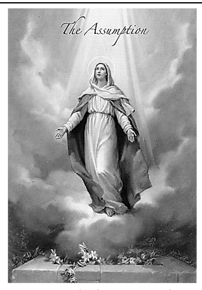
Our Lady of Mount Carmel Pray for Us 19th Sunday in Ordinary Time

120 Prospect Street, Nutley, New Jersey 07110 August 11, 2024