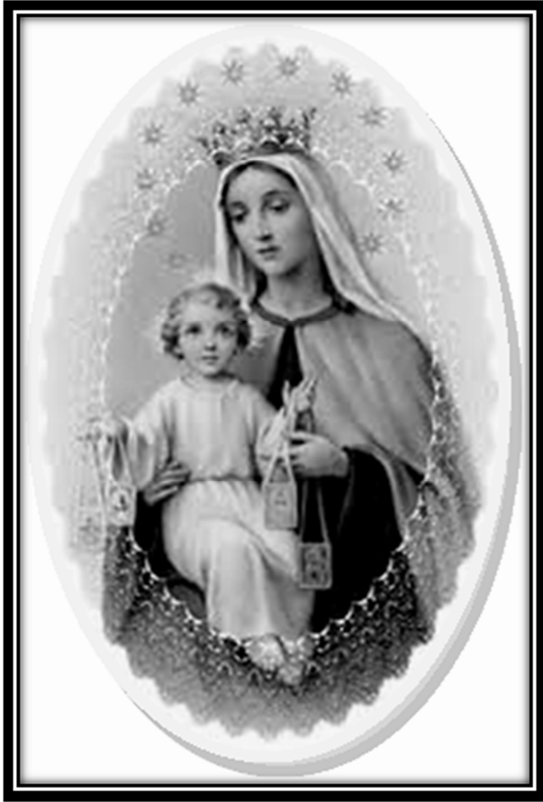
Our Lady of Mt. Carmel Pray for Us