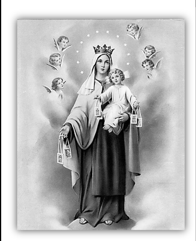
21st Sunday in Ordinary Time Our Lady of Mt. Carmel Pray for Us

120 Prospect Street, Nutley, New Jersey 07110 August 27, 2023