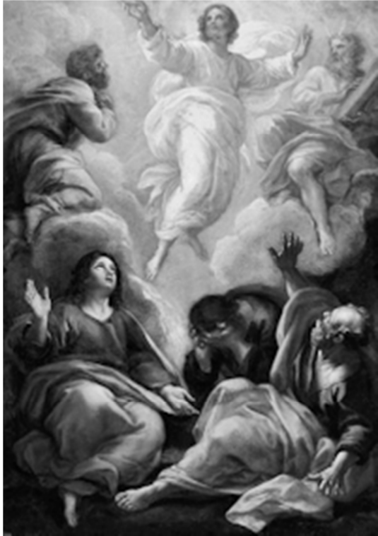
The Transfiguration of the Lord