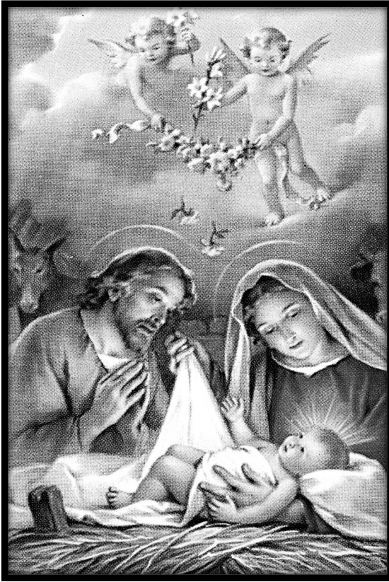
The Holy Family Jesus, Mary and Joseph