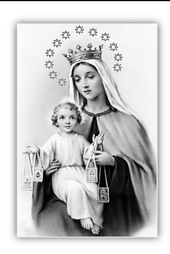
Our Lady of Mount Carmel Pray for Us 6th Sunday in Ordinary Time

120 Prospect Street, Nutley, New Jersey 07110 February 11, 2024