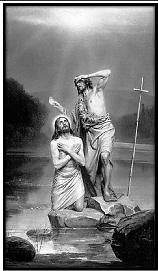
The Baptism of the Lord