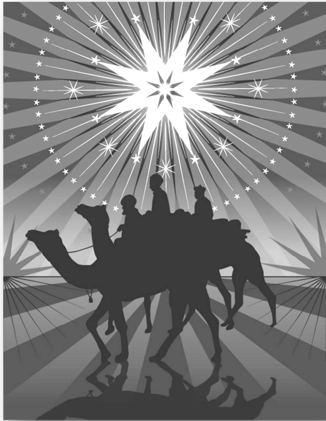
The Epiphany of the Lord