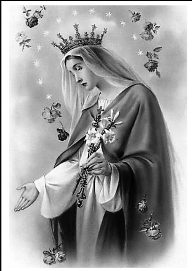
Our Lady of Mount Carmel Pray for Us 16th Sunday in Ordinary Time

120 Prospect Street, Nutley, New Jersey 07110 July 21, 2024