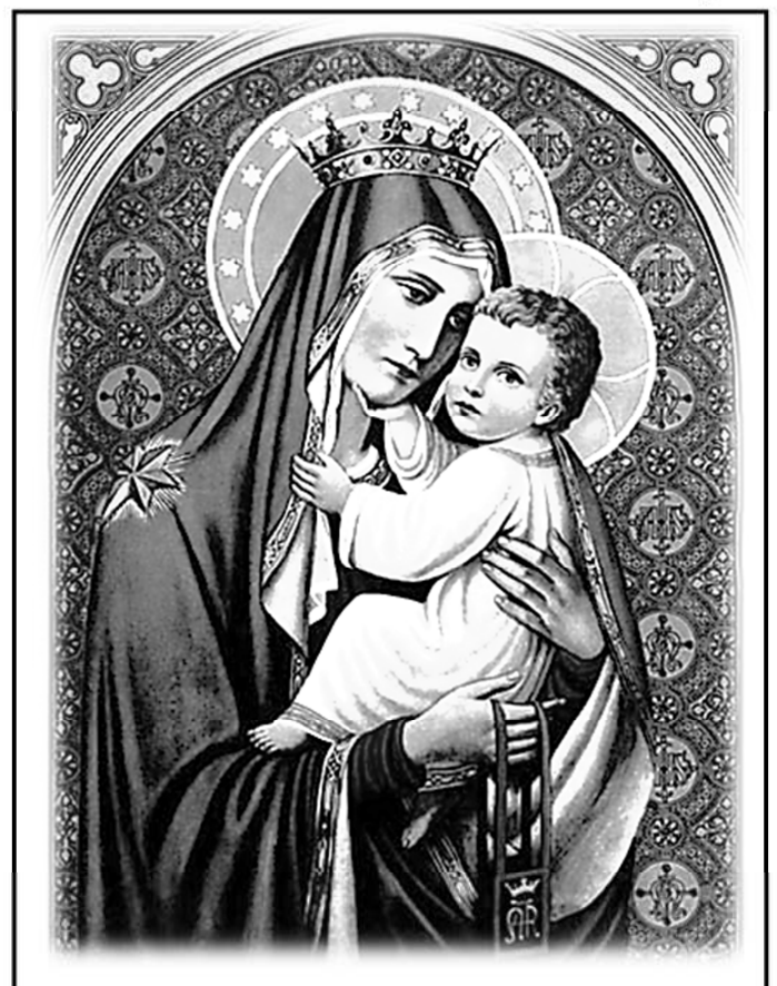
Our Lady of Mount Carmel Pray for Us 17th Sunday in Ordinary Time

120 Prospect Street, Nutley, New Jersey 07110 July 30, 2023