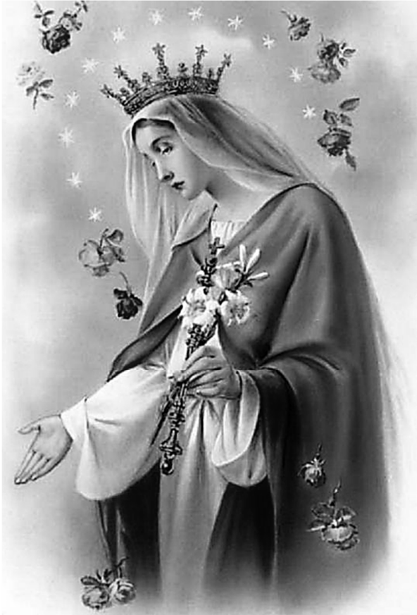
Our Lady of Mount Carmel Pray for Us 6th Sunday of Easter