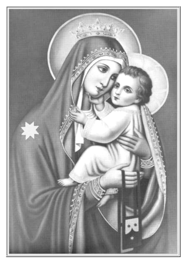
32<sup>nd</sup> Sunday in Ordinary Time Our Lady of Mt. Carmel Pray for Us

120 Prospect Street, Nutley, New Jersey 07110 November 12, 2023