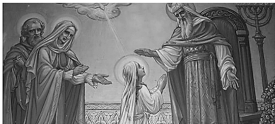
THE PRESENTATION OF THE BLESSED VIRGIN MARY.