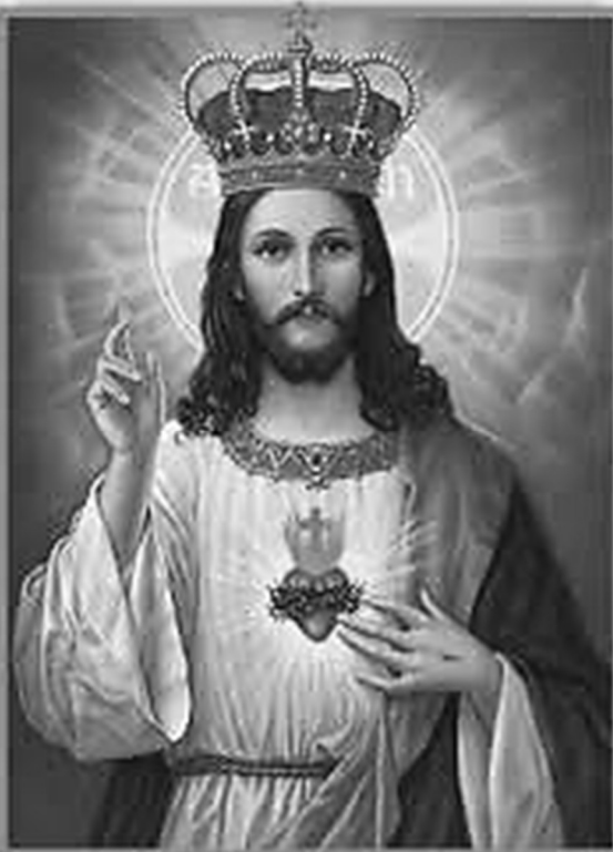
Our Lord Jesus Christ, King of the Universe