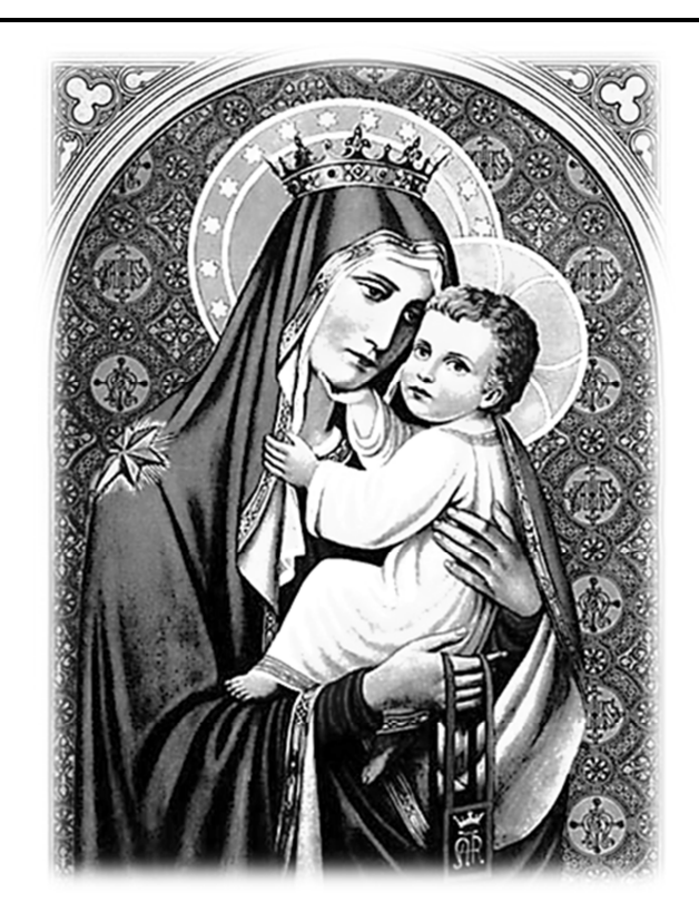
28<sup>th</sup> Sunday in Ordinary Time Our Lady of Mt. Carmel Pray for Us

120 Prospect Street, Nutley, New Jersey 07110 October 15, 2023