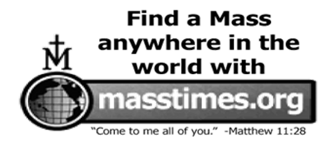
World Mission Sunday

Visit our website www.olmc-nutley.org to read updated information, check out the latest bulletin, get Religious Education news, Mass schedules, find out more information about our various organizations events, and much more. Pay us a visit!