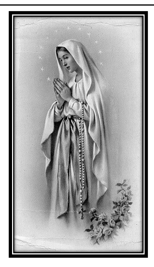
27<sup>th</sup> Sunday in Ordinary Time Our Lady of Mt. Carmel Pray for Us

120 Prospect Street, Nutley, New Jersey 07110 October 8, 2023