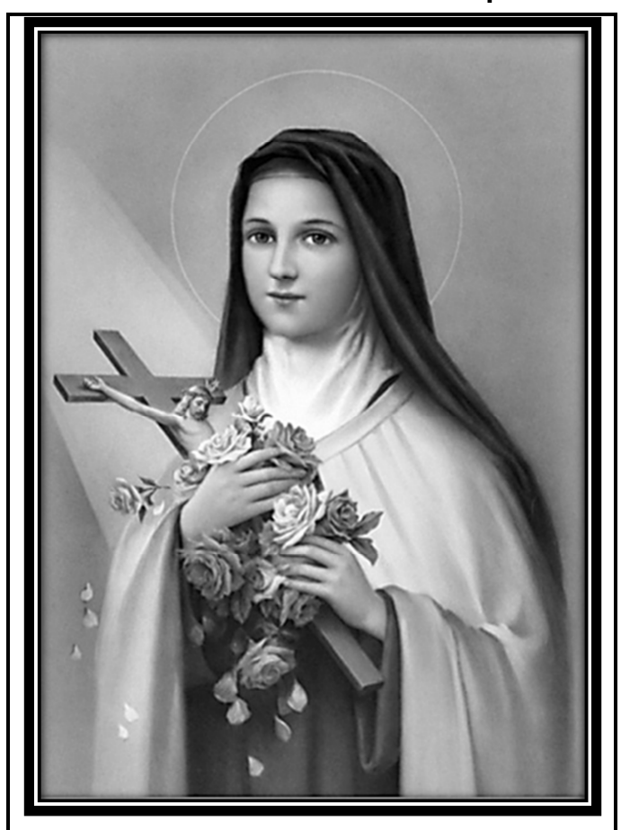
25<sup>th</sup> Sunday in Ordinary Time Our Lady of Mt. Carmel Pray for Us

120 Prospect Street, Nutley, New Jersey 07110 September 24, 2023